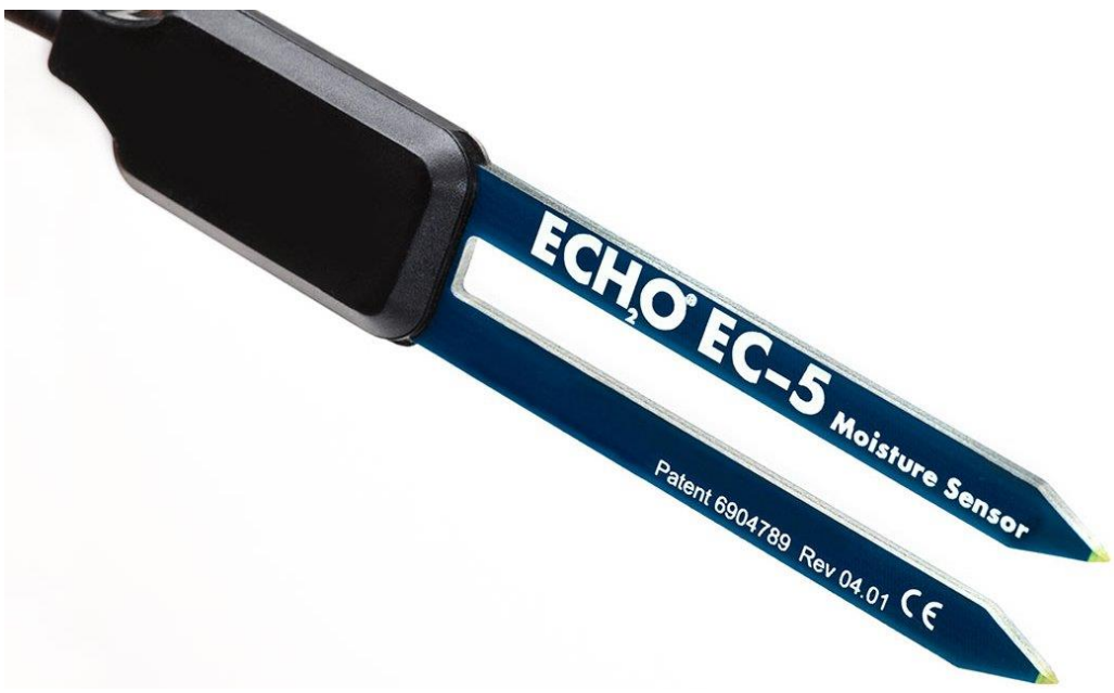
EC-5 soil moisture sensor

It appears that in the near future growers may automate irrigation using sensors to water plants efficiently and improve plant quality. The technology is currently available, and guidelines for its use are being developed. But, what's next? In the future, we wish to gain a better grasp of how water use changes depending on the location of a crop in the greenhouse (for example, proximity to cooling pads or fans), the number of plants grown, and environmental factors. An exciting new development is that the newer 5TE probes can measure both substrate EC and water content. This may allow growers to control both irrigation and fertilization simultaneously.